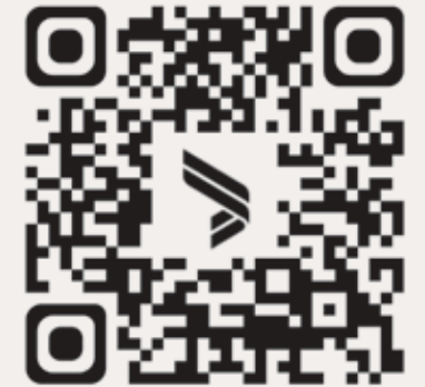
Scan this code for a full list of our generous donors.

Bryan Medical Center: $5,669,197 Crete Area Medical Center: $185,977 Kearney Regional Medical Center: $414,159 Bryan College of Health Sciences: $3,379,673 Grand Island Regional Medical Center: $110,106 Merrick Medical Center: $76,460 Other entities: $319,543